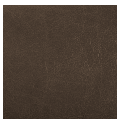
Dark Brown Saddle Leather