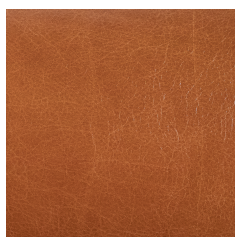
Tan Saddle Leather