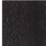
Grey Carbalho Veneered