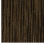
Oak Veneered Dyed Wengé