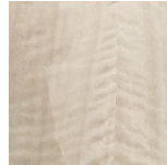
Eucalyptus Frisé Veneered