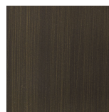
Brushed Dark Bronze